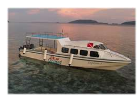
One of our resort transfer boats, "Explorer 5"

Papua Explorers Resort has scheduled transfers to the island from Sorong every Sunday and Wednesday with our own transfer boat. Our boat leaves at latest at 12:00 noon and we strongly recommend our guests to arrange their flights to arrive earlier than this. In case the guests cannot catch these transfers, we can provide special transfers at an extra cost. Although we do our best to accommodate late arrivals due to flight delays, we may not be able to wait for long if there are other guests in the boat. In these cases, special transfers will need to be arranged for the guests that arrive late. Our guests will be greeted by our ground crew upon arrival at Sorong and taken for clean bathrooms and breakfast (free of charge)