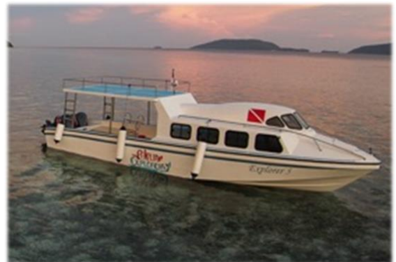
One of our resort transfer boats, "Explorer 5"

Papua Explorers Eco Resort has scheduled transfers to the island from Sorong every Sunday and Wednesday with our own transfer boat. Our boat leaves at latest at 12:00 noon and we strongly recommend our guests to arrange their flights to arrive earlier than this. Although we do our best to accommodate late arrivals due to flight delays, we may not be able to wait for long if there are other guests in the boat. In these cases, special transfers will need to be arranged for the guests that arrive late. Our guests will be greeted by our ground crew upon arrival at Sorong and taken for clean bathrooms and breakfast (free of charge) at a nearby hotel until the boat is prepared for departure and all the guests have arrived.